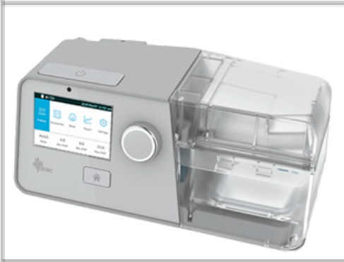
G3 B20A / B25A)