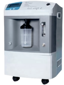
JAY-5lit / 10lit