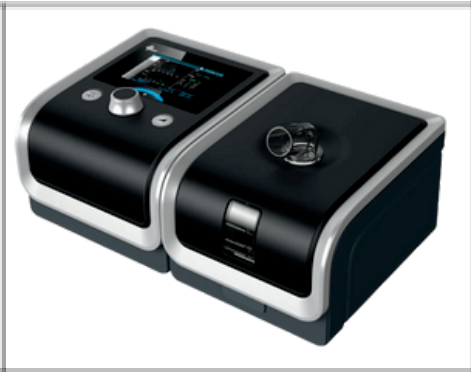
Y-25T / Y-30T