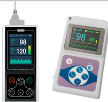
CMS-60D1 & 60D