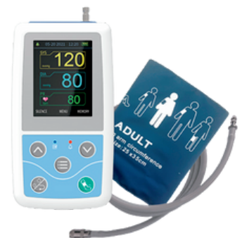
ABPM-50 & 100