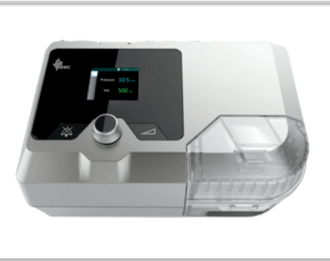
G2S B25VT / B30VT